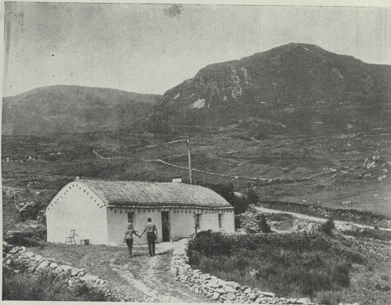
WEAVER'S COTTAGE, NEAR ARDARA