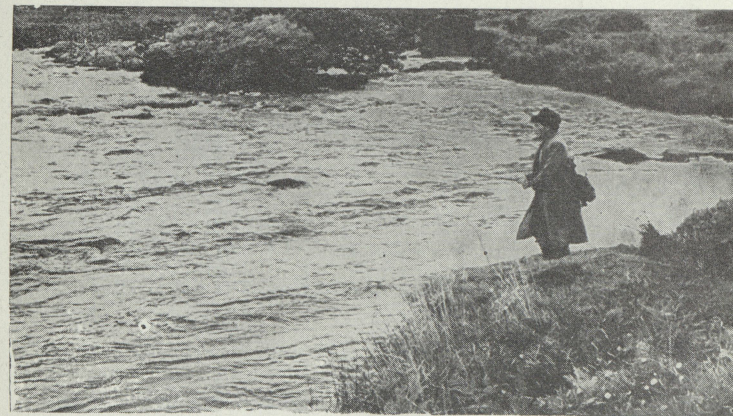
OWENEA RIVER IN SPATE