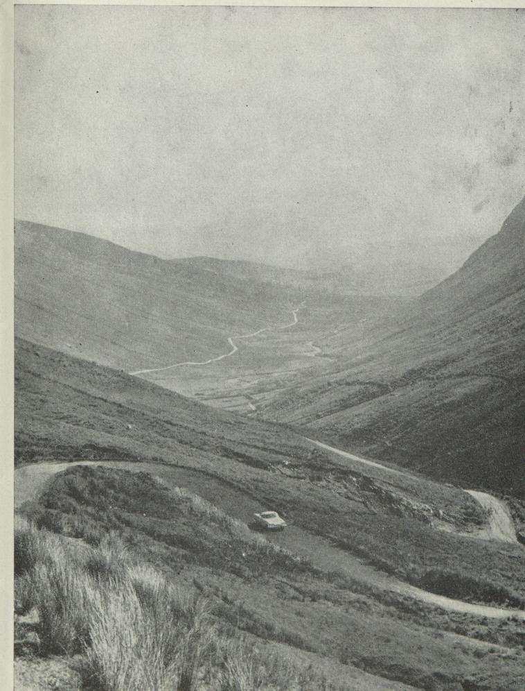
GLENGESH PASS - 3 miles from Ardara - 1,250 ft.